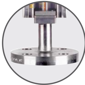
5700 Bulk Tank Gauge with Optional Flange Connection

The 5700 and 17000 series gauges are armored liquid level gauges with NPT or flanged connections at each end. These gauges provide a visual means for checking the contents of a bulk tank. They can also be used to set and monitor the injection rate of a chemical metering pump. The gauges operate in low to medium pressure applications up to 500 psig.