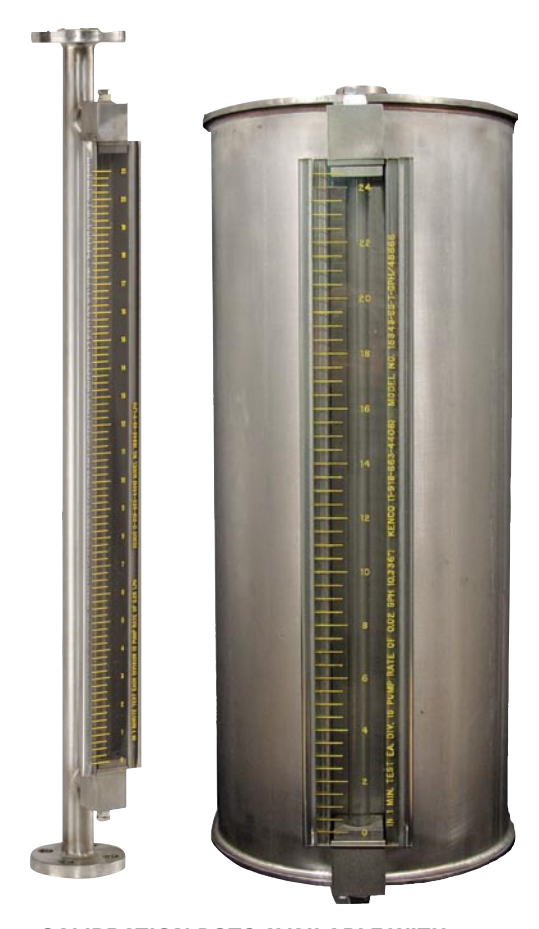
CALIBRATION POTS AVAILABLE WITH FLANGED OR THREADED CONNECTIONS